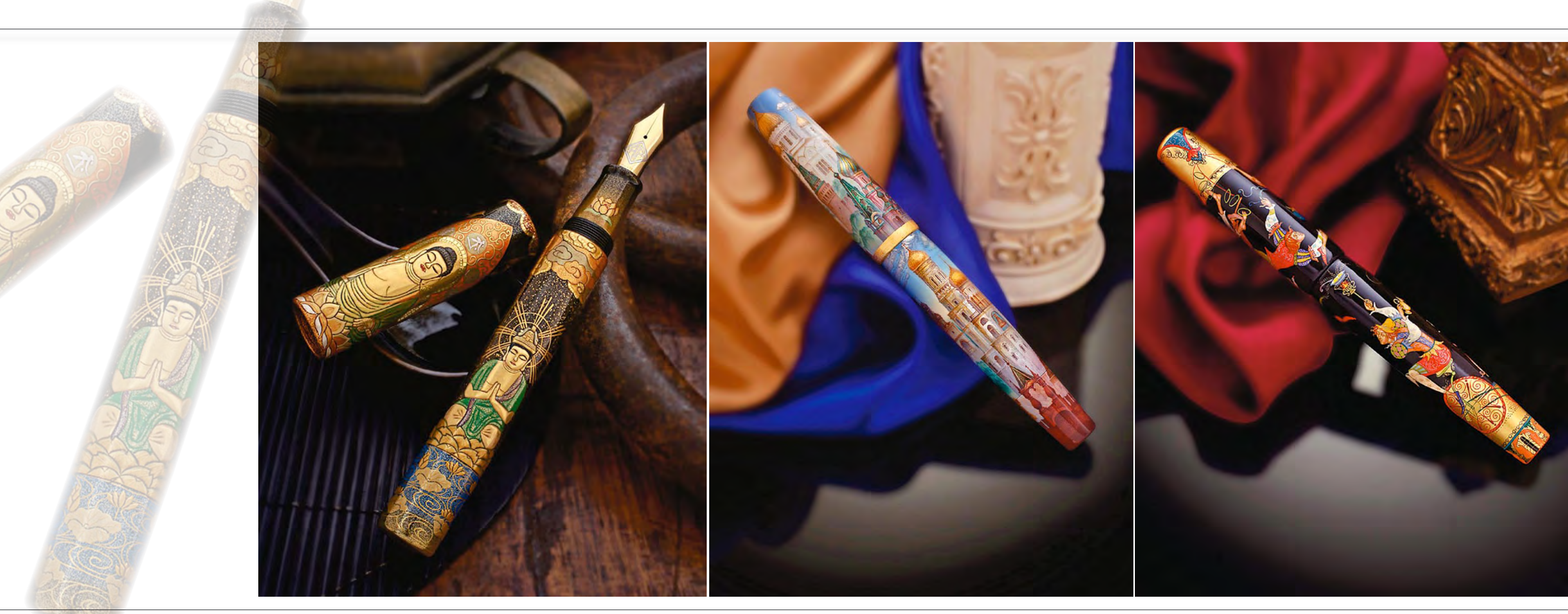
The intricate art on each AP Limited Editions' pen-piece lets the owner appreciate different cultures and religions