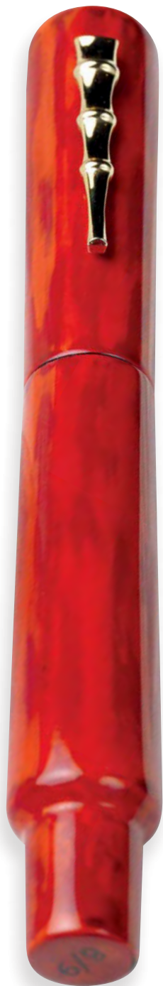
Simple and elegant Writers Series Red Lamont, available in nine each of rollerball and fountain pen

At the other end of the price spectrum, a bespoke pen service has recently been introduced allowing customers to define what they want on one-of-a-kind, individualized projects. One early client was the Sultan of Oman; a current client is a Chinese customer who wants a pen that depicts his Buddhist garden.