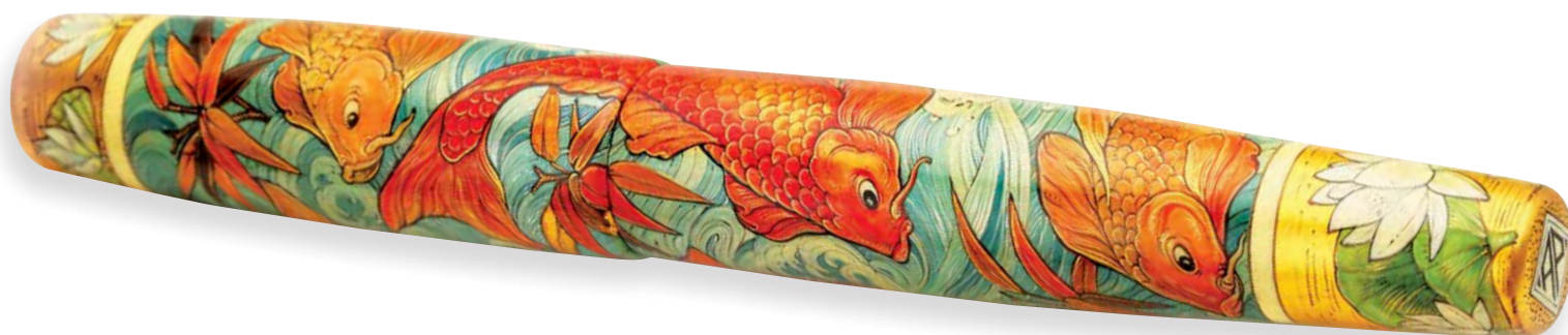
Goldfish; Rabbits in a Summer Garden

Some fountain pens are pieces of fine art. Some fountain pens are excellent writing instruments. AP Limited Editions seeks to create a fountain pen that is both.