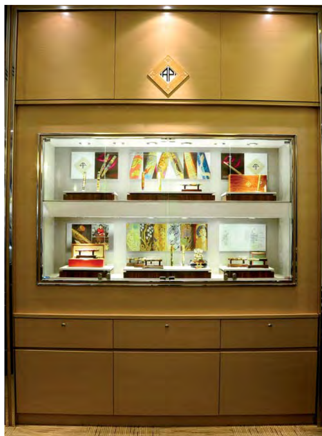
AP Limited Editions display at the renowned Singapore retailer Aesthetic Bay

to carry when traveling, a simple black Platinum that one of his maki-e artists embellished into a beautiful one-of-a-kind jewel. “I love Japanese nibs,” he says.