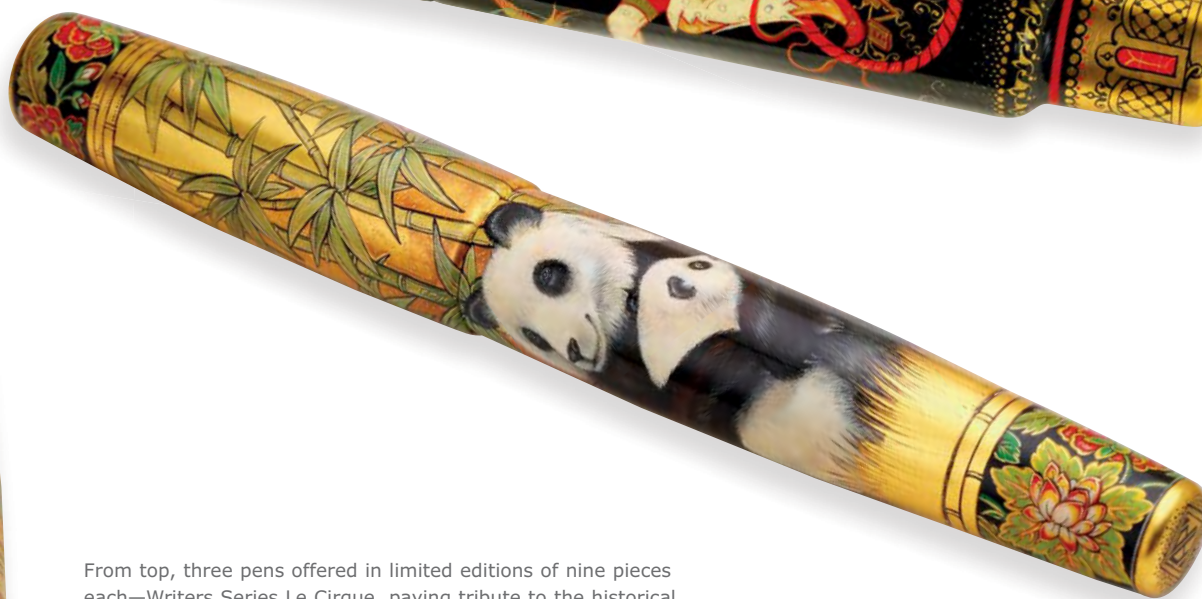
From top, three pens offered in limited editions of nine pieces each—Writers Series Le Cirque, paying tribute to the historical circus of Russia; The Lovable Giant Panda; and The Celebrations at the Private Garden of Emperor Qianlong.