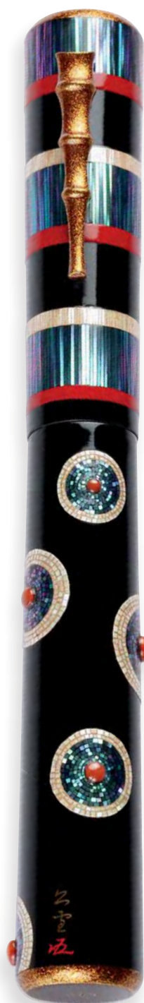
Writers Series maki-e Prayer Wheel pen, inspired by the Tibetan prayer wheel used by Buddhists. The inlays are abalone, mother-of-pearl, and coral.

The Almighty Shiva pen depicts one of the most enigmatic deities of the Hindu pantheon borne upon the back of the Divine Nandi. The edition is limited to nine pieces.